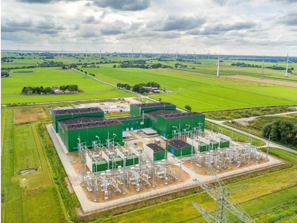
The completed NordLink converter station in Wilster (Germany), summer 2020.

If you need the photos in higher resolution, please contact the TenneT press office at presse@tennet.eu