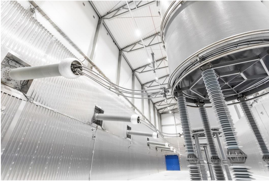
The NordLink converter station in Tonstad from inside: Here a view into the choke hall.