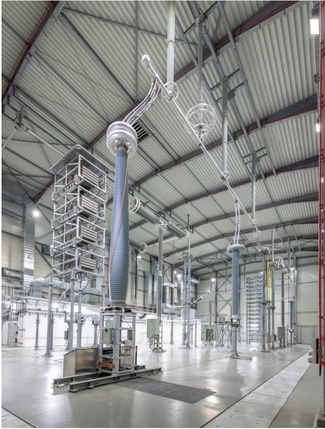
The DC hall in the converter station in Wilster.