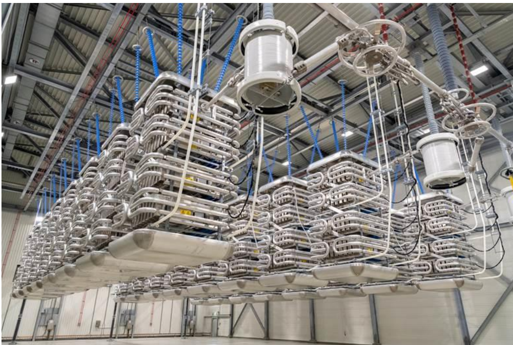
The NordLink converter plant in Wilster: A look inside the valve hall.