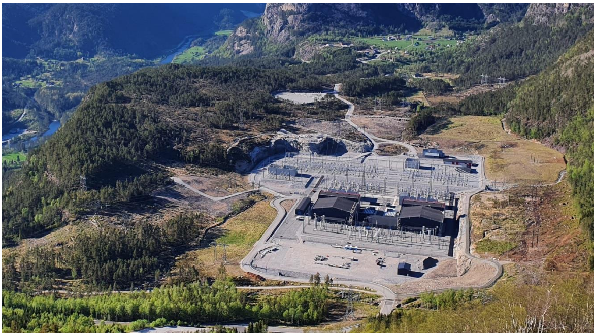
The completed NordLink converter station in Tonstad, Norway, spring 2020